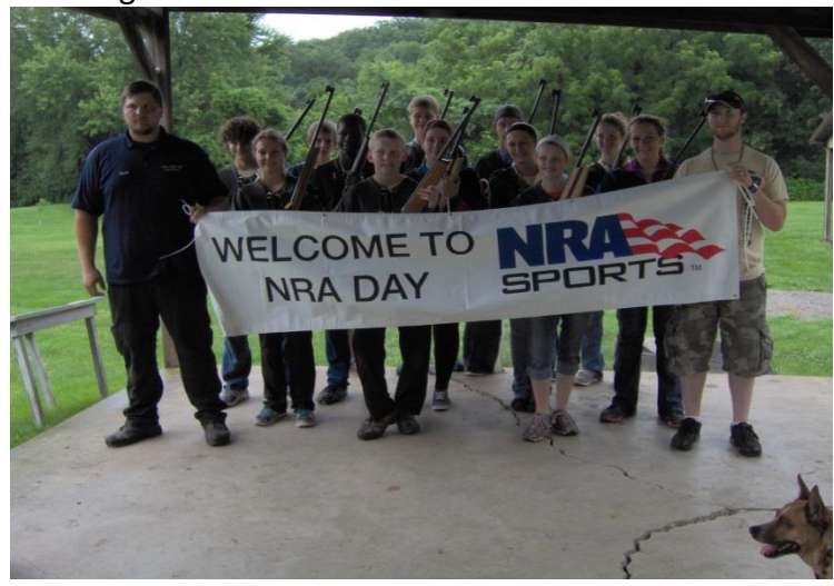
Second camp participants

Thanks are due to all the staff who donated their time and experience at the camps. Also thanks to the parents for bringing their juniors to the camps, and a big thank you to Bucksnort Gun Club who continues to support us with the use of their shooting facilities