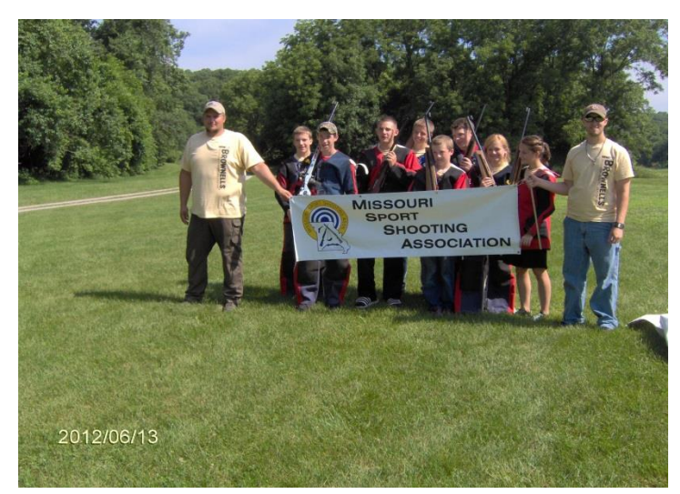
First camp participants