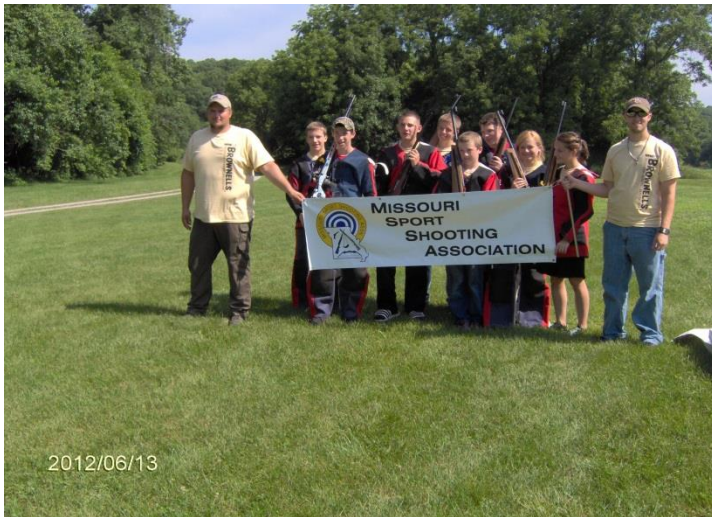
First camp participants