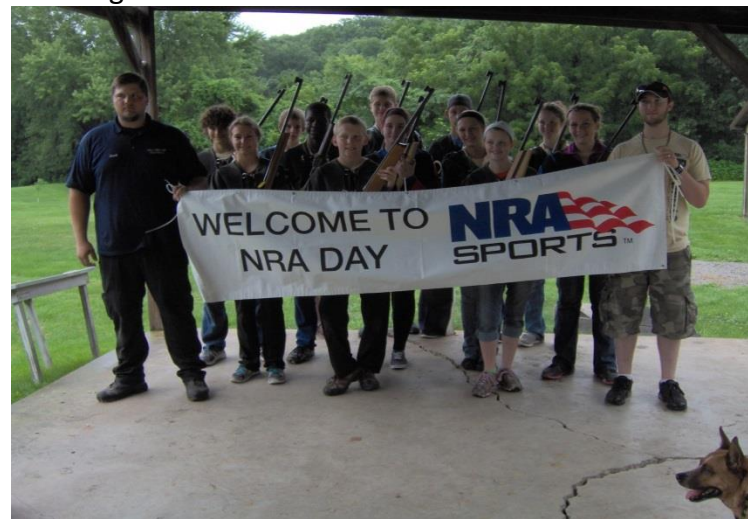
Second camp participants

Thanks are due to all the staff who donated their time and experience at the camps. Also thanks to the parents for bringing their juniors to the camps, and a big thank you to Bucksnot Gun Club who continues to support us with the use of their shooting facilities