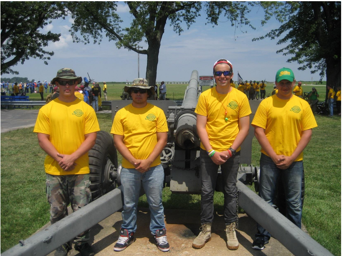
Missouri Junior High Power Team at Camp Perry, OH in August 2013.

Alas, at the end of two weeks of Sun, fun, and less money than some, we loaded up our gypsy wagon full of high power gear and headed for home. Never a doubt we would return again and always the hope that next year will be better than the last.