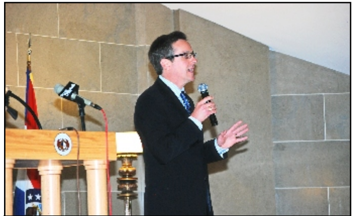
Senator Kurt Schaefer