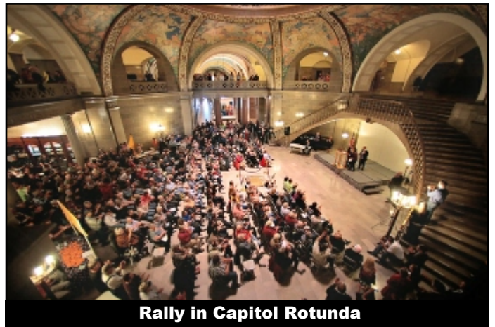
Rally in Capitol Rotunda