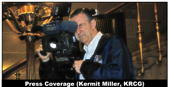
Press Coverage (Kermit Miller, KRCG)

There were many more speakers from the House and Senate who made an appearance at the Rally than can be shown here.