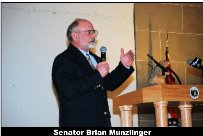
Senator Brian Munzlinger