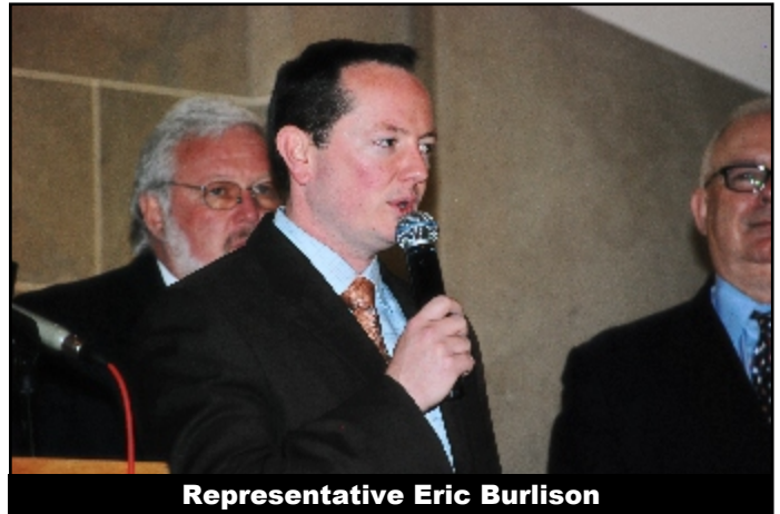
Representative Eric Burlison