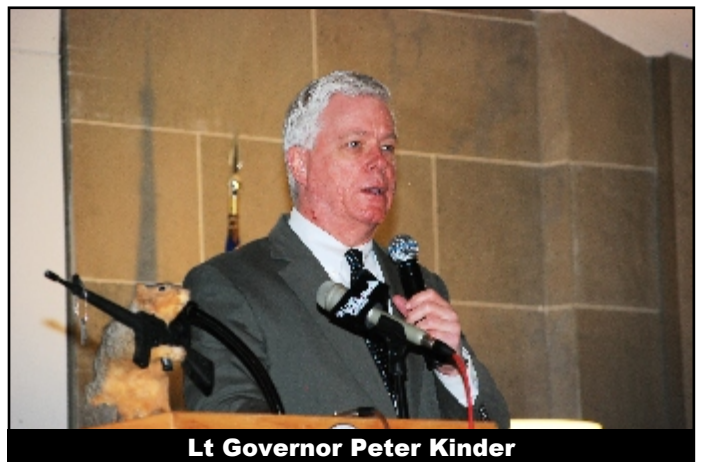
Lt Governor Peter Kinder