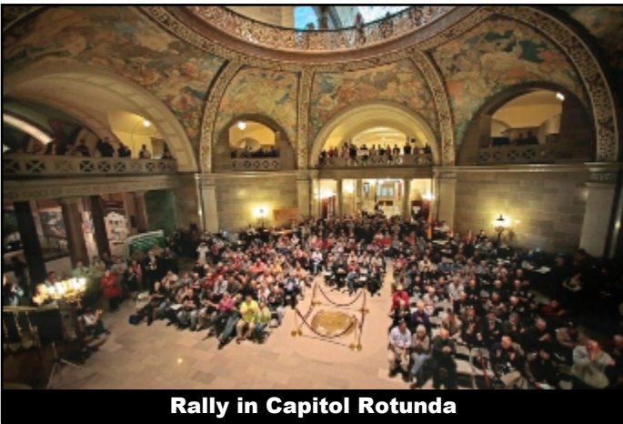
Rally in Capitol Rotunda