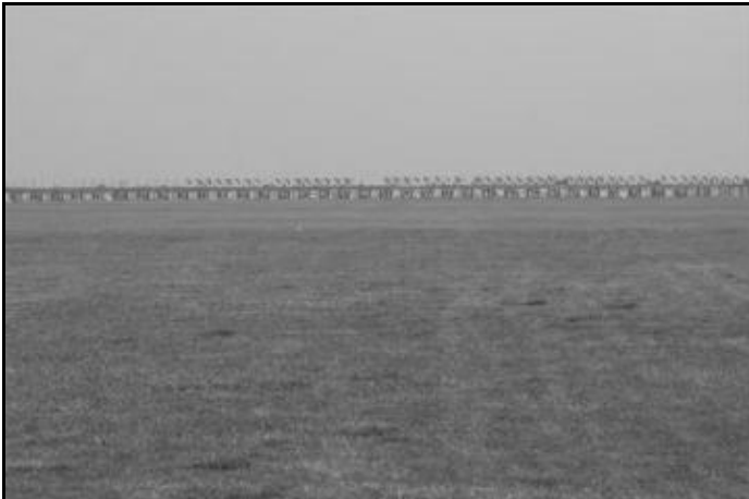
Rodriguez Rifle Range during the NTIT Match (event on page 8)