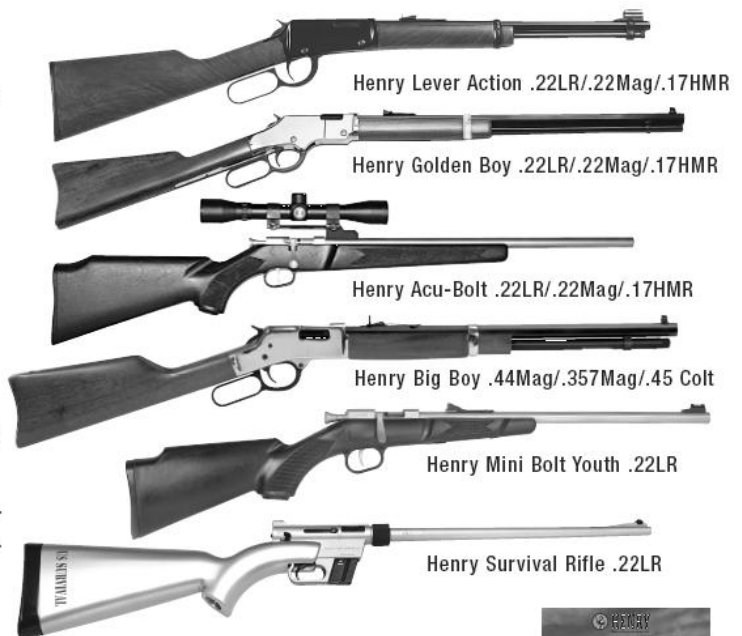
Henry Lever Action .22LR/.22Mag/.17HMR

Phone: (718) 499-5600 • Fax: (718) 768-8056 www.henry-guns.com