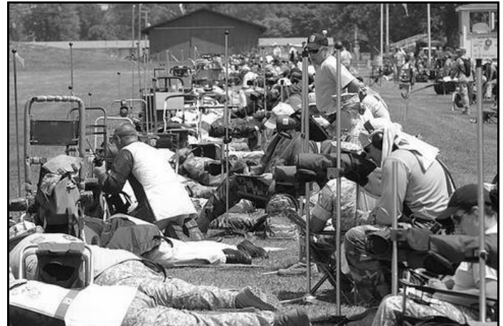
The Firing Line on Rodriguez Range