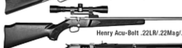
Henry Acu-Bolt .22LR/.22Mag/.17HMR