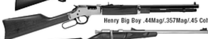
Henry Big Boy .44Mag/.357Mag/.45 Colt