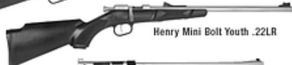
Henry Mini Bolt Youth .22LR