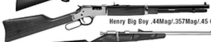
Henry Big Boy .44Mag/.357Mag/.45 Colt