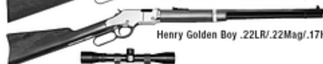
Henry Golden Boy .22LR/.22Mag/.17HMR