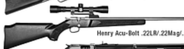
Henry Acu-Bolt .22LR/.22Mag/.17HMR