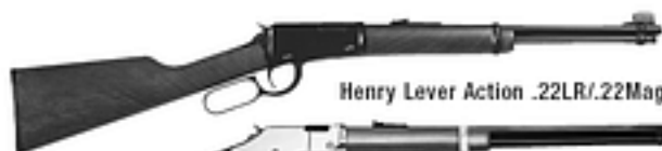
Henry Lever Action .22LR/.22Mag/.17HMR

WWW.HENRY-GUNS.COM , mail the coupon or call 718-499-5600 for our free catalog containing information on all our rifles as well as a list of gun shops in your area.