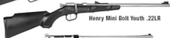
Henry Mini Bolt Youth .22LR